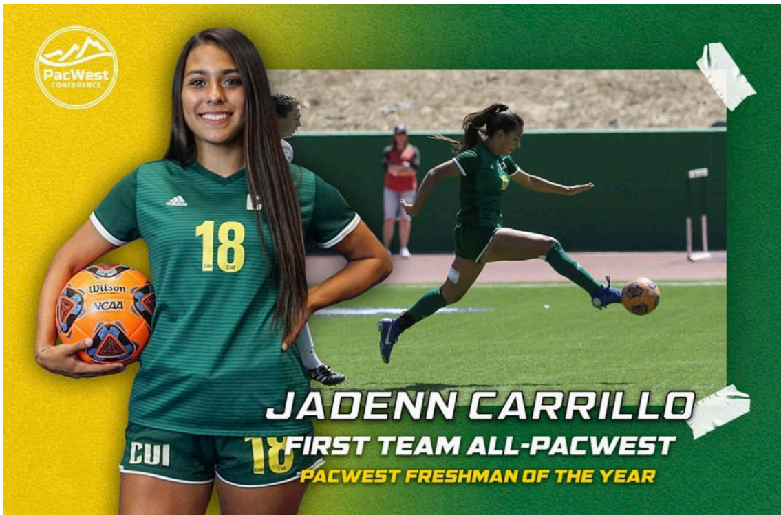
PICTURED ABOVE: