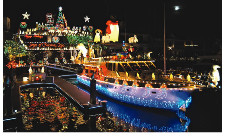
PICTURED ABOVE: The Newport Beach Christmas Boat Parade light up the harbor.