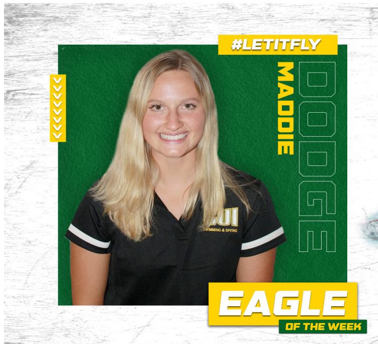
PICTURED ABOVE