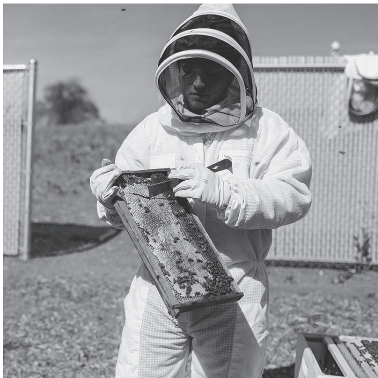
PICTURED ABOVE: Students work with beehives in Heritage Garden.