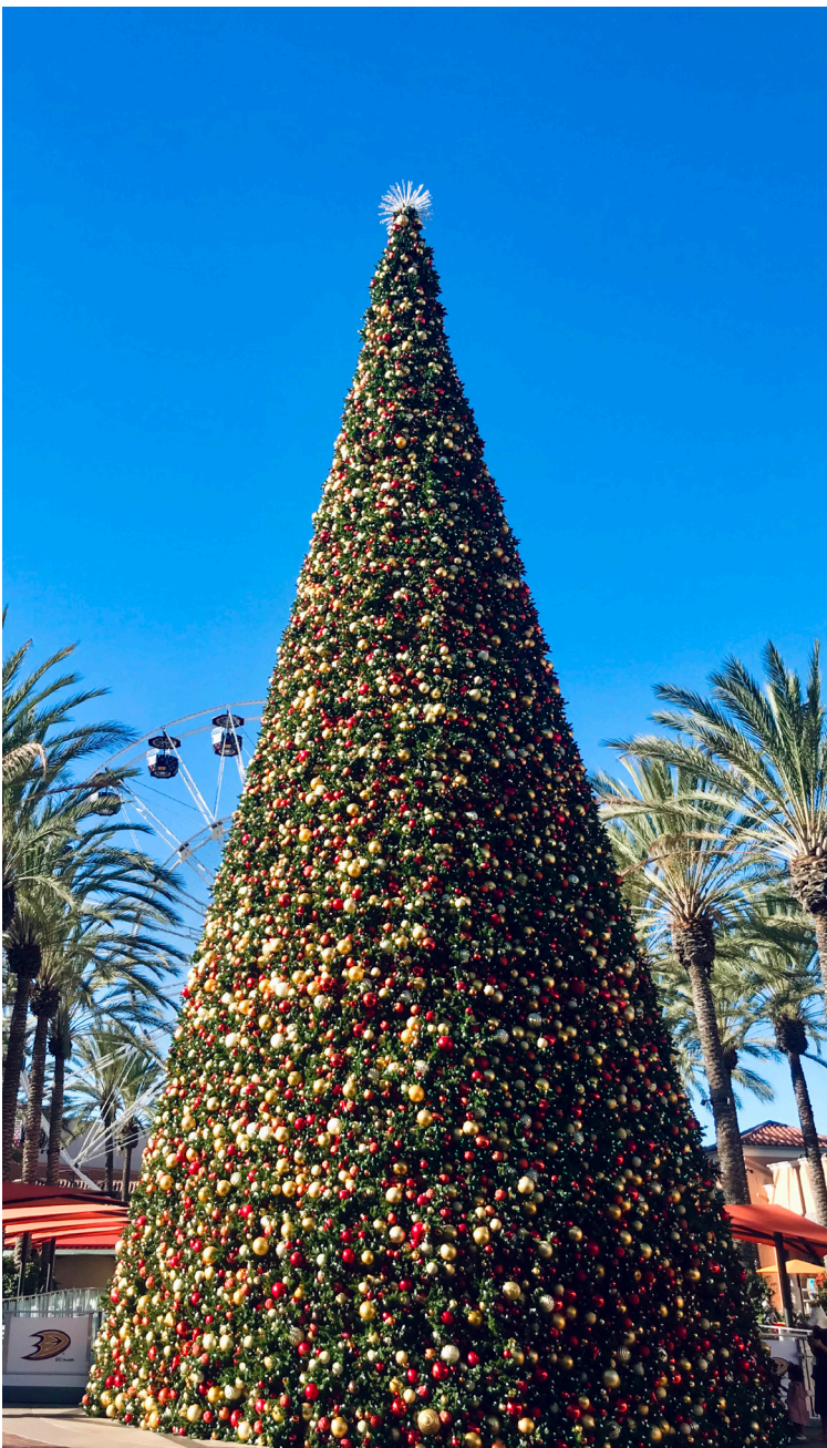
PICTURED ABOVE: Christmas tree at Irvine Spectrum.